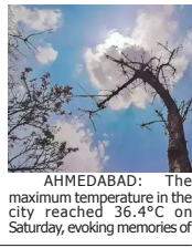
AHMEDABAD: The maximum temperature in the city reached 36.4°C on Saturday, evoking memories of summer, as it was a significant 4.1 degrees above normal.

The maximum temperature in the city reached 36.4°C on Saturday, evoking memories of summer, as it was a significant 4.1 degrees above normal. The minimum temperature, which stood at 26.5°C, was also higher than usual by 1.7 degrees. Light rainfall is expected in certain areas of coastal Saurashtra and South Gujarat over the next five days.